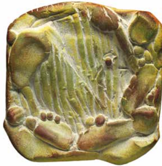
8. Steyn: Model for the obverse of Cattle Creek , 2016, clay, 75mm.

reverse inscription fitted into the rough contour of the medal (fig. 9). In the final version, of the figure in the wilderness, only some engraved lines give the illusion of a body, suggesting a kind of classical contrapposto .