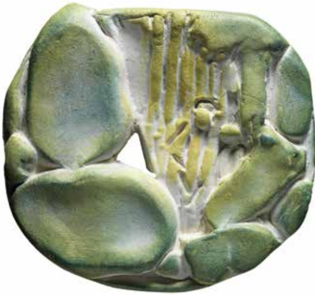
5. Steyn: Cattle Creek , 2016, clay, 85mm.