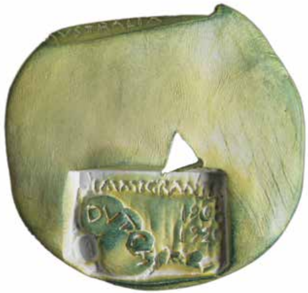
11. Steyn: Model for the reverse of Cattle Creek , 2016, clay, 75mm.