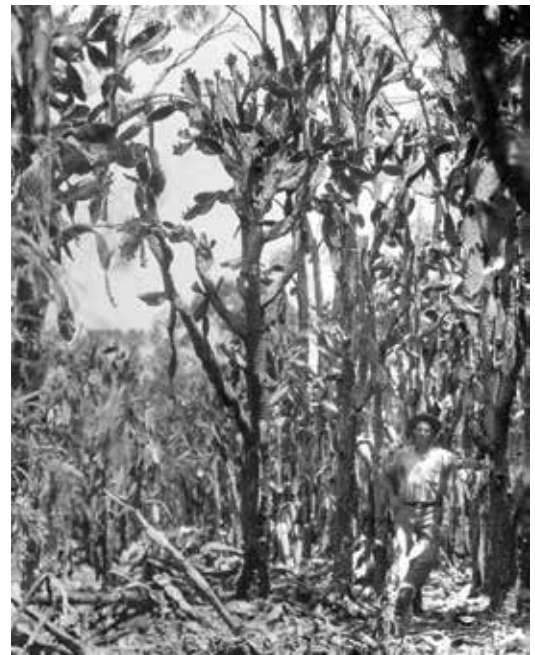
4. A settler in Australia , c.1910.

an echo of the map of Australia, with the very substantial stamp of The Company imprinted over the location of Brisbane.