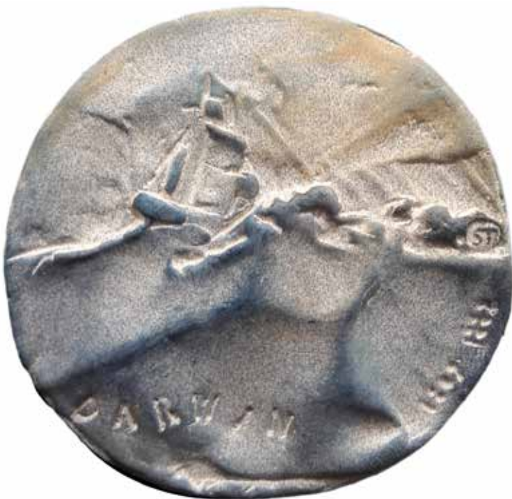
14. Steyn: The Beagle in Summertime , 2017, clay, 95mm.