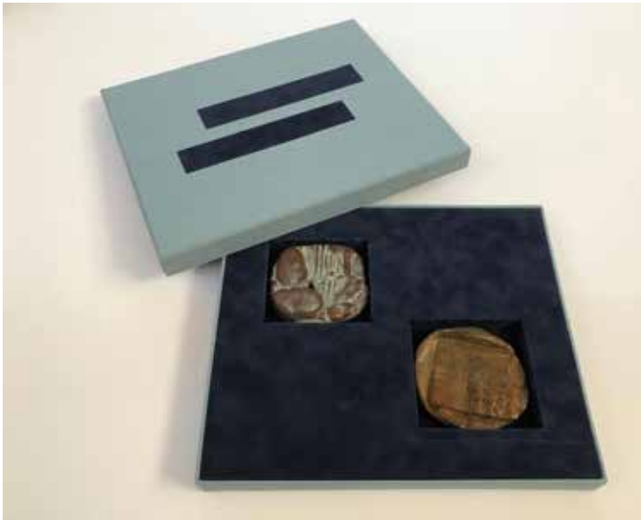
13. Steyn: The Company Award , 2019, bronze in a specially designed box, 200 x 200 x 15mm.