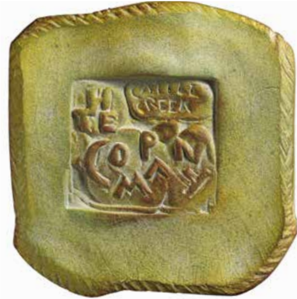
9. Steyn: Model for the reverse of Cattle Creek , 2016, clay, 75mm.