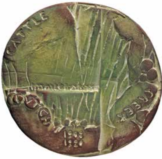
7. Steyn: Model for the obverse of Cattle Creek , 2016, clay, 75mm.