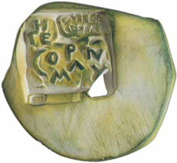
10. Steyn: Model for the reverse of Cattle Creek , 2016, clay, 75mm.