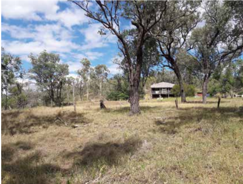
12. The 1930s house, Cattle Creek , 2019.

prickly pears have reappeared everywhere.